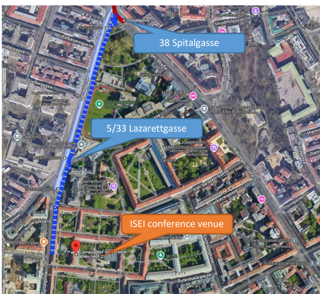
1: Walk from Campus to tram 38

You can buy tickets inside the tram (cash only) or online at: